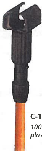
C-14BWRP 100% recycled plastic