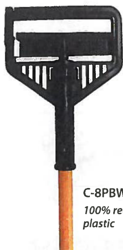
C-8PBWRP 100% recycled plastic