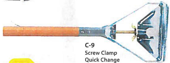
C-9 Screw Clamp Quick Change