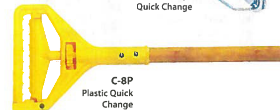
C-8P Plastic Quick Change