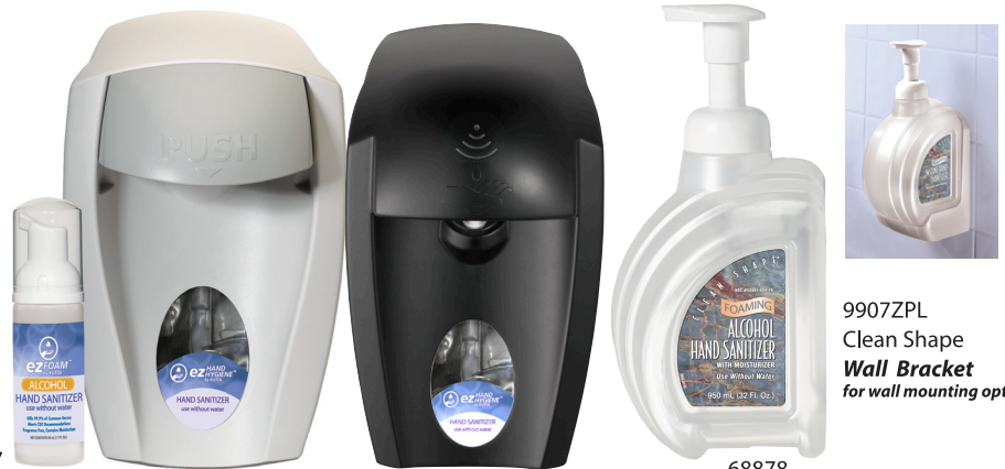
68817 Hand-held bottle 50mL /24 per case